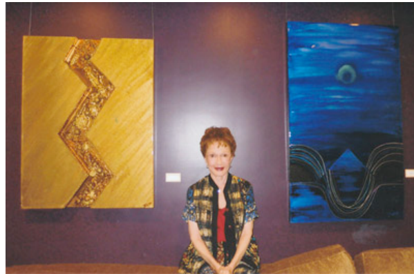
"River of Gold" 40"x30" Wall Sculpture