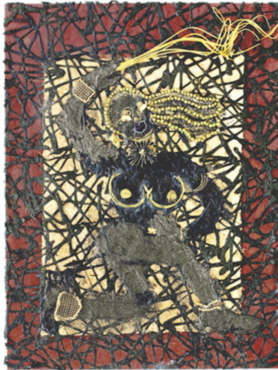
"FUNKY MONKEY" Mixed Media 40"H X 30"W